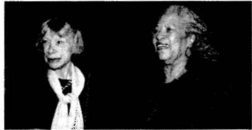
Joan Didion, NBA Lifetime Achievement honoree, along with Toni Morrison, past recipient of the same award.