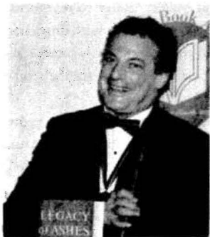
Nonfiction winner Tim Weiner.